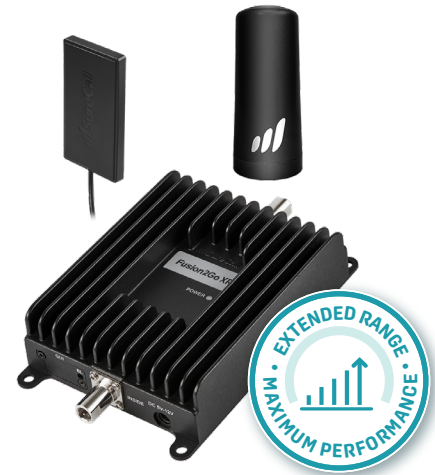
Fusion2Go XR Fleet booster kit